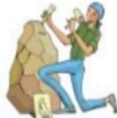
( sculptor - reporter )