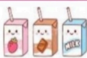
( trends - flavor )